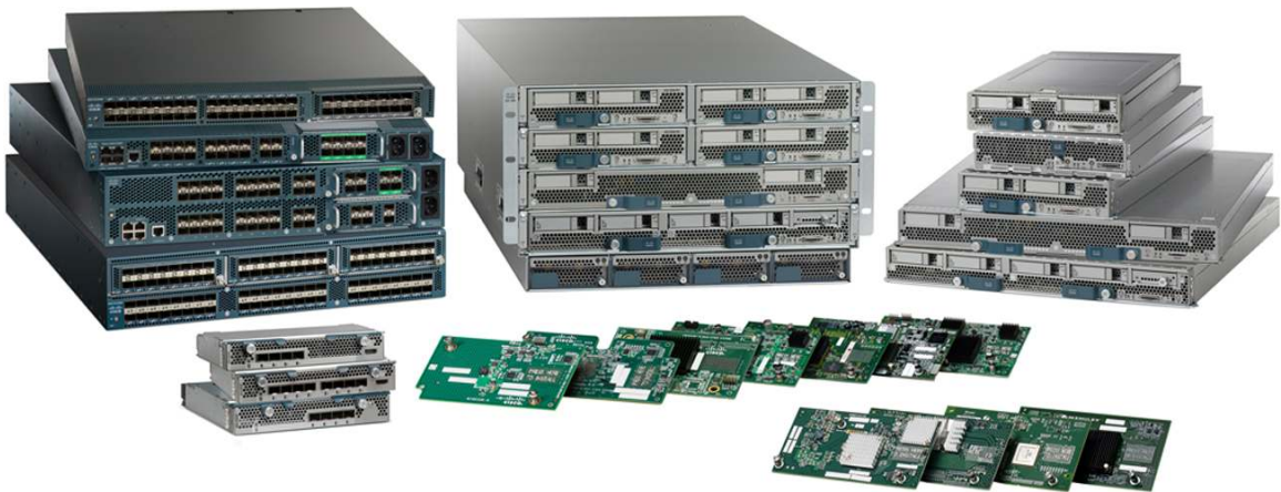
Figure 2. Cisco UCS 6200 Series Fabric Interconnects

From a networking perspective, the Cisco UCS 6200 Series uses a cut-through architecture, supporting deterministic, low-latency, line-rate 10 Gigabit Ethernet on all ports, switching capacity of 2 terabits (Tb), and 320-Gbps bandwidth per chassis, independent of packet size and enabled services. The product family supports Cisco® low-latency, lossless 10 Gigabit Ethernet 1 unified network fabric capabilities, which increase the reliability, efficiency, and scalability of Ethernet networks. The fabric interconnect supports multiple traffic classes over a lossless Ethernet fabric from the blade through the interconnect. Significant TCO savings come from an FCoE-optimized server design in which network interface cards (NICs), host bus adapters (HBAs), cables, and switches can be consolidated.